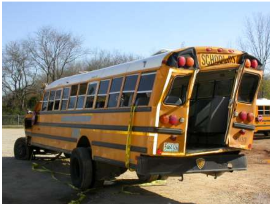
Figure 5. Twisted bus frame and open rear emergency exit door resulting from impact with ground.