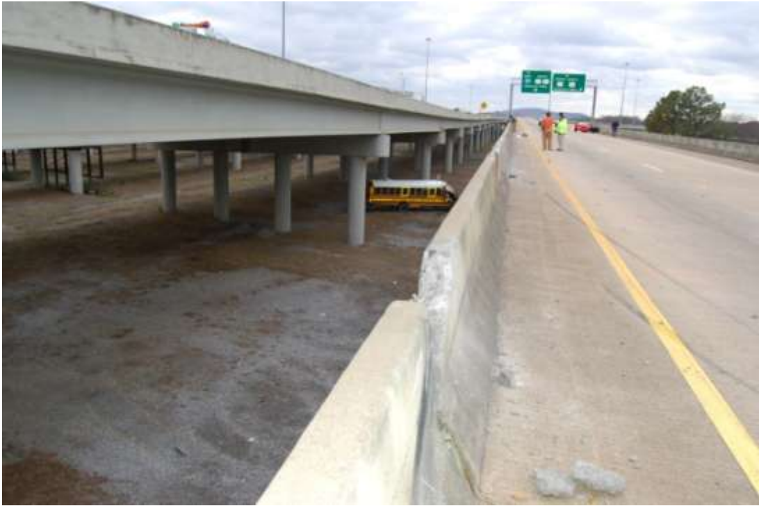
Figure 2. Impact damage caused by school bus, westbound I-565 transition ramp bridge rail.