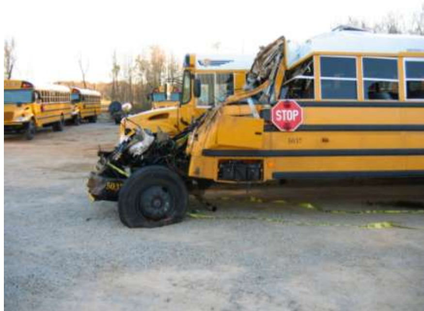
Figure 4. Extent of damage to front of accident school bus, compared with exemplar school bus.