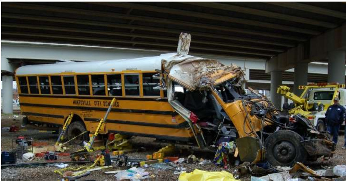
Figure 3. School bus at final rest position.